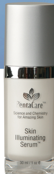
(350) 30 ml.